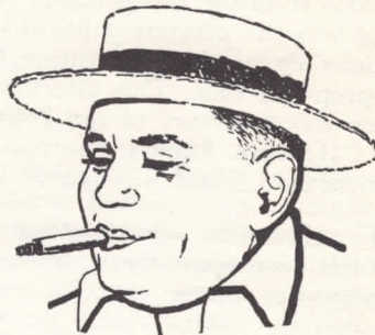
ARTIE SAMISH POLITICAL GANGSTER

"To hell with the governor of the State! I'm the governor of the legislature."