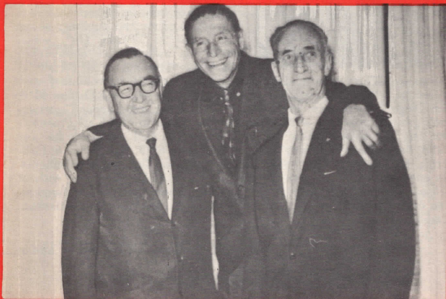
Governor "Pat" Brown fraternizing with Communist Stalwarts Harry Bridges and Benny Bufano

FORMER F.B.I. COUNTERSPY WITHIN THE COMMUNIST CONSPIRACY